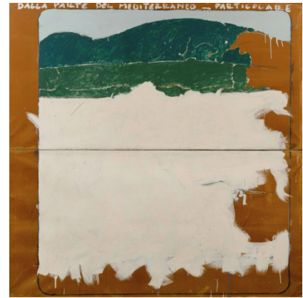
Mario Schifano, sold for CHF 180 500