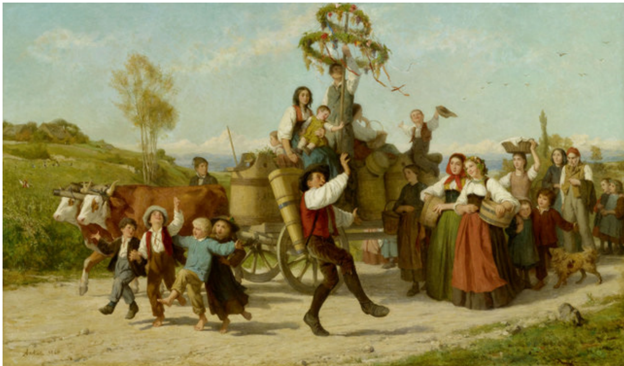
Albert Anker, sold for CHF 4.2 million

PostWar & Contemporary Paintings & Prints, Swiss Art and Watches all attained over 100% sold by value.