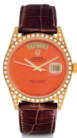
Rolex Day Date, sold for CHF 41 300

The high demand for vintage watches continued in Koller's second dedicated watch auction, with bidders competing for timepieces from the 50s to the 90s. The top lot was a gold Patek Philippe chronograph from 1994 which realized CHF 65 300 / GBP 43 500 (lot 2551), followed by a quite trendy Rolex Day Date with a coral-colored dial with diamonds from 1995 (lot 2587) which demolished its low estimate of CHF 18 000, selling for CHF 41 300 / GBP 27 500. Subtly elegant, a Patek Philippe "Cuervo y Sobrinos" from 1955 realized CHF 37 700 / GBP 25 100 (lot 2554), and a classic and sporty Breguet Aviator Type XX chronograph from the 1960s soared above its low estimate of CHF 9 000 / GBP 6 000 to reach CHF 24 500 / GBP 16 300 (lot 2514). Over 90% of the lots in the auction found buyers, and the large majority of lots were sold above their pre-sale estimates.