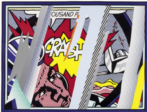
Roy Lichtenstein, sold for CHF 108 500

Roy Lichtenstein's "Reflections on Crash" led the bidding in Koller's Prints and Multiples auction, selling for CHF 108 500 / GBP 72 300 (lot 3751). Also among the top lots were two Warhol silkscreens, "Dollar Sign (1)" and "Paramount," which realised CHF 42 500 and 30 500 / GBP 28 300 and 20 300 (lots 3277 and 3266). Somewhat less predictably, however, many graphic works by less pricey artists such as Victor Vasarely or Sonia Delaunay also did extremely well, often tripling their estimates. A collection of Picasso ceramics also sold very well. Overall the auction was one of the most successful in Koller's recent history, with prices realised totalling over 160% of the pre-sale estimates.